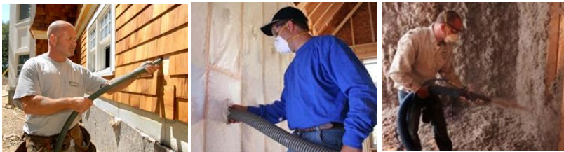
Kits for Dense Pack, Blow Behind Netting, and Spray-on