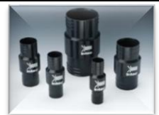
Swivel hose connectors & hose kits