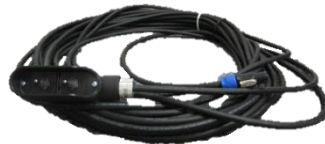
System shown with standard heavy duty wired remote & industry exclusive urethane jacketed controls for enhanced durability

Intec's FORCE/2 HP comes with these industry leading components on which it has built its reputation for durability and reliability: